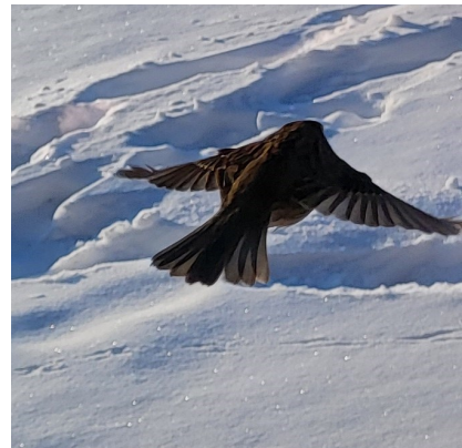
With the Lord enjoy your day!